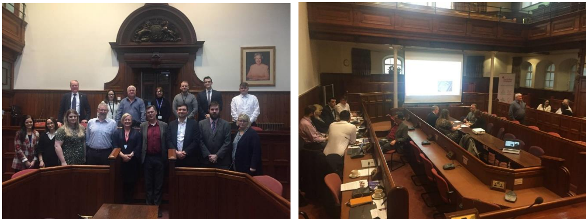
Photos taken at the North West Scrutiny Networking Event hosted by South Lakeland District Council at Kendal Town Hall on 11 February 2020.