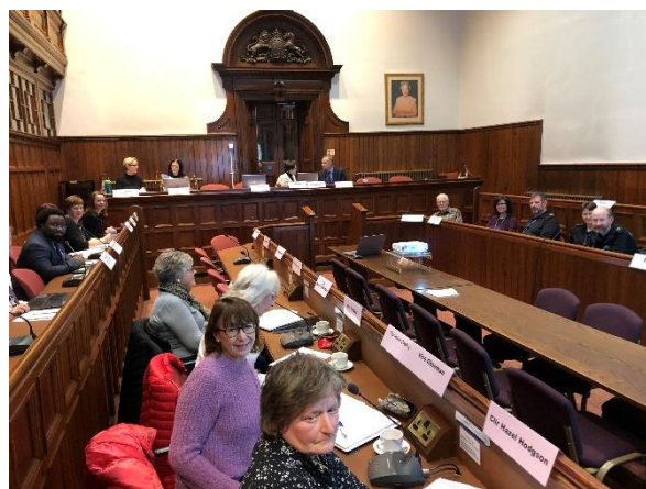
Photos taken at the Locality Working Partnership Task and Finish Group on 31 January 2020.